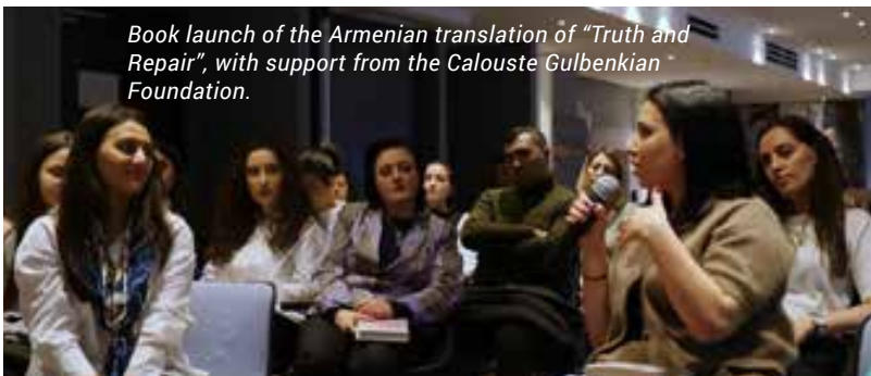
Book launch of the Armenian translation of "Truth and Repair", with support from the Calouste Gulbenkian Foundation.