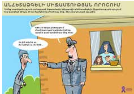
16 Days Activism Against Gender-Based Violence campaign, in collaboration with MediaLab.