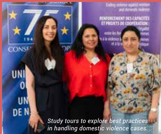
Study tours to explore best practices in handling domestic violence cases.