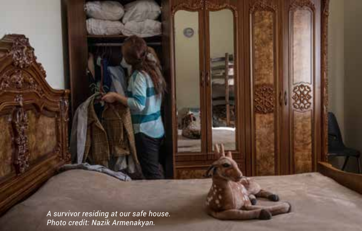
A survivor residing at our safe house.