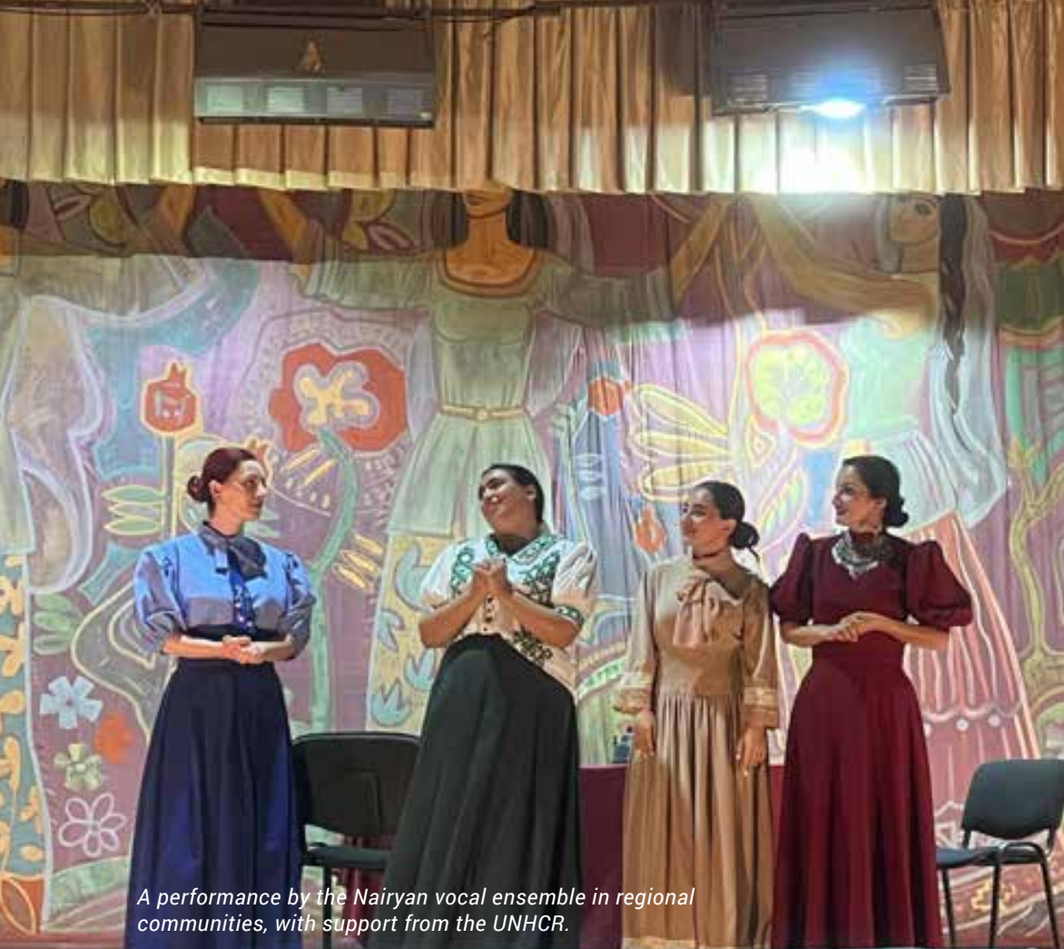
A performance by the Nairyan vocal ensemble in regional communities, with support from the UNHCR.