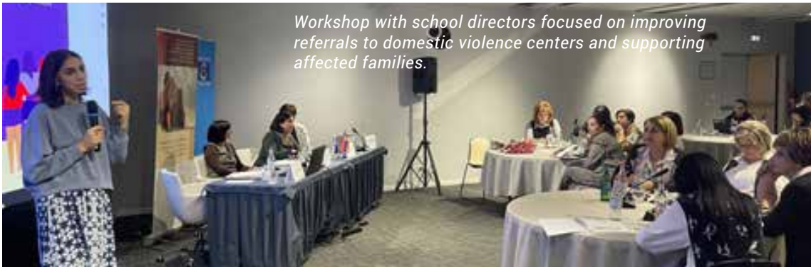
Workshop with school directors focused on improving referrals to domestic violence centers and supporting affected families.