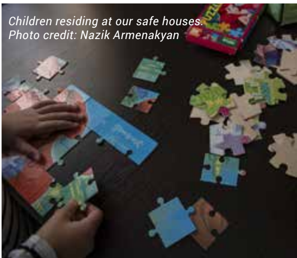
Children residing at our safe houses.