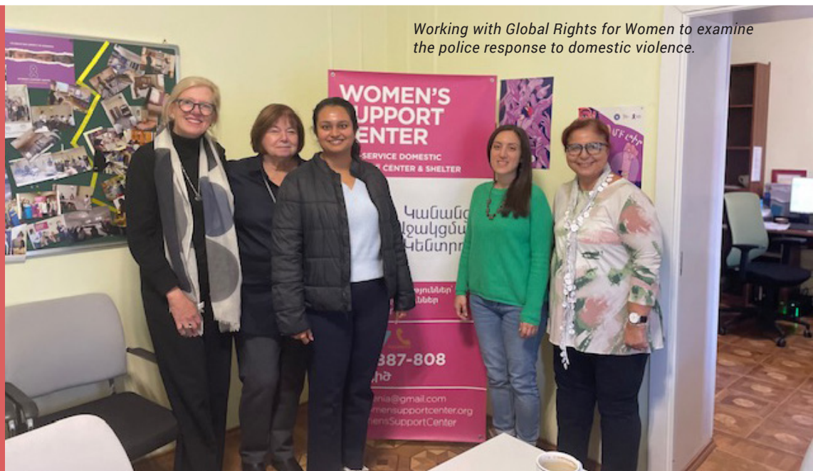
Working with Global Rights for Women to examine the police response to domestic violence.