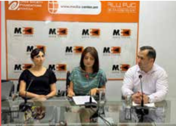
Press conference about the amended domestic violence law.