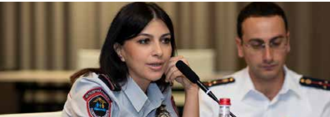
Training for police officers and investigators, in collaboration with the Council of Europe.