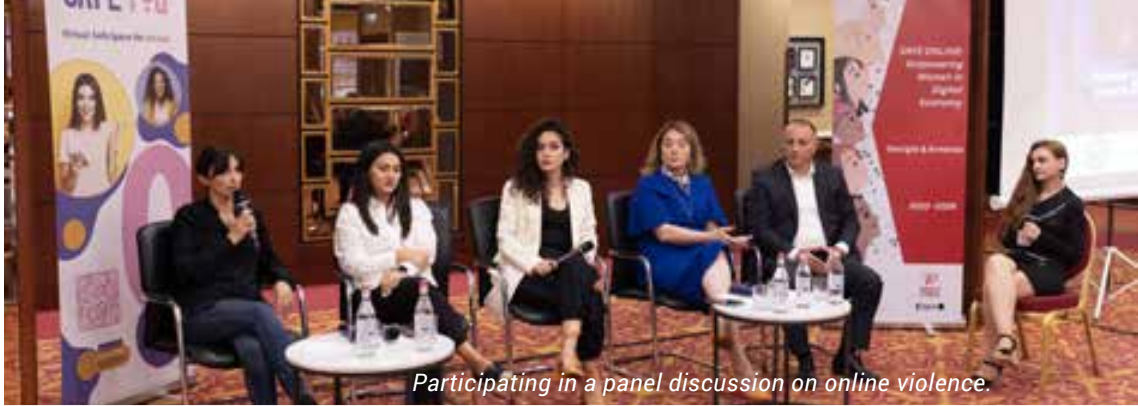
Participating in a panel discussion on online violence.