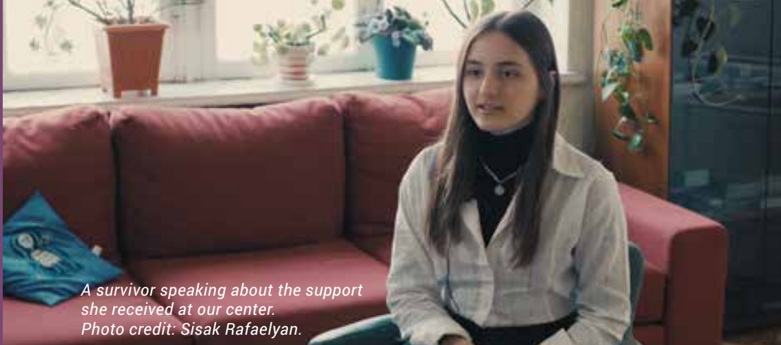
A survivor speaking about the support she received at our center.