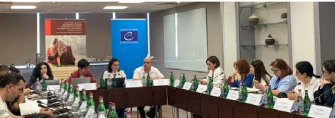
Gathering to discuss recent amendments to the domestic violence law.