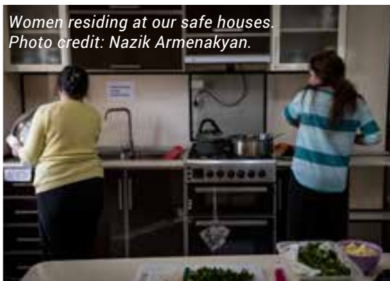
Women residing at our safe houses.